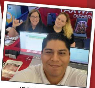
IRS TAX FORUM SAN DIEGO, CA