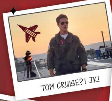
TOM CRUISE?! JK!